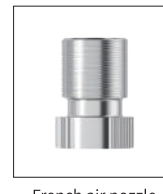
French air nozzle converter head

Mountain bikes, electric bikes, motorcycles, cars will be equipped with American air nozzle. Aeration: Connect the American air nozzle with the American air nozzle interface on the high pressure gas pipe to aerate. Deflate: Deflate with a suitable tool (such as a 4mm hex needle). Wrench press the gas inside the air nozzle.