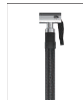
American style air nozzle