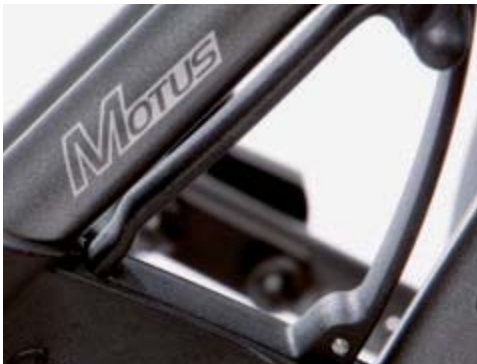
Frame color: anthracite metallic

* Applicable to push ring attachment, narrow (for push ring attachment, wide: + 20 mm / 0.79 in) and a 0° camber of the rear wheels.