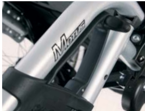
Frame color: silver metallic